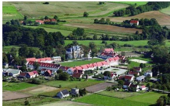
The New Kreisau (2006)

Next year, the New Kreisau and the Kreisau Initiative e.V. will celebrate their 30 th anniversary. Since the efforts of an international civic movement, which even before the political change in 1989/90 made plans for the revival of Kreisau as a European meeting site in the spirit of the Kreisau Circle, many people and institutions have been committed there to support German-Polish and European understanding. The encounter and memorial work, which is supported by our Foundation, is more than ever of great relevance. Thus, its preservation also determines the purpose of the Freya von Moltke Foundation : Together with all its supporters, we want to secure the important work of the New Kreisau – today and in the future!