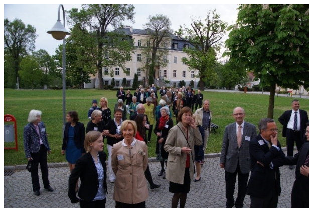
The Kreisau trip in May 2015