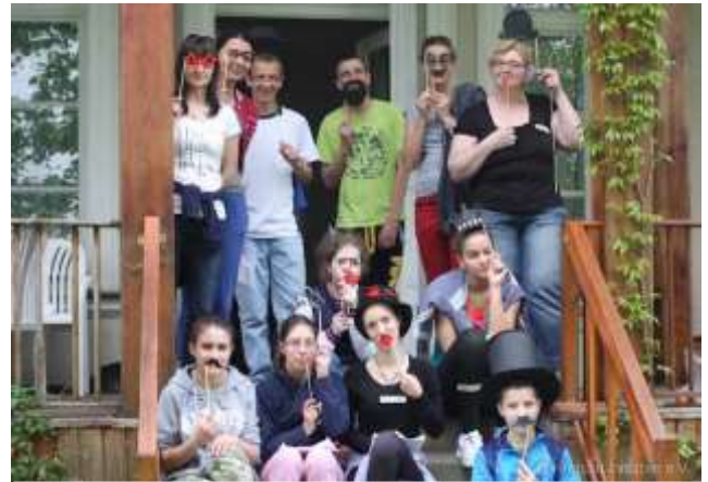
Young people at a workshop in Kreisau

In 2015, we reflected on the fragile state of Europe. Our yearly theme: "Europe under Construction" refers to the European crisis and approaches to solving it. This inspired our projects and the events we supported in Kreisau. Above all, projects dealing with the causes, conditions and effects of migrations in the history and present of Europe were included in the sponsorship. The project "Refugees in Europe - Welcome to Paradise?" (€ 6,758) was aimed at young people from Germany, Poland and Greece, while the training for specialists of the non-formal education "Activists against Xenocide" (€ 2,000) was as well a meeting for young people from Denmark, Germany, Estonia and Great Britain. The well-proved format "Forum Dialogue" (2,000 € funding) brought together children aged 10 to 14 from socially, economically and geographically disadvantaged society groups in Germany, Poland and the Ukraine. In these and other projects supported by the Foundation with a total amount of € 18,023 every one of the nearly 200 participants received the opportunity to meet not only peers from other countries but also to gain knowledge and competences with regard to one of the most pressuring problems of Europe and the world and to develop an empathic view. The donations of our donator have made this possible!